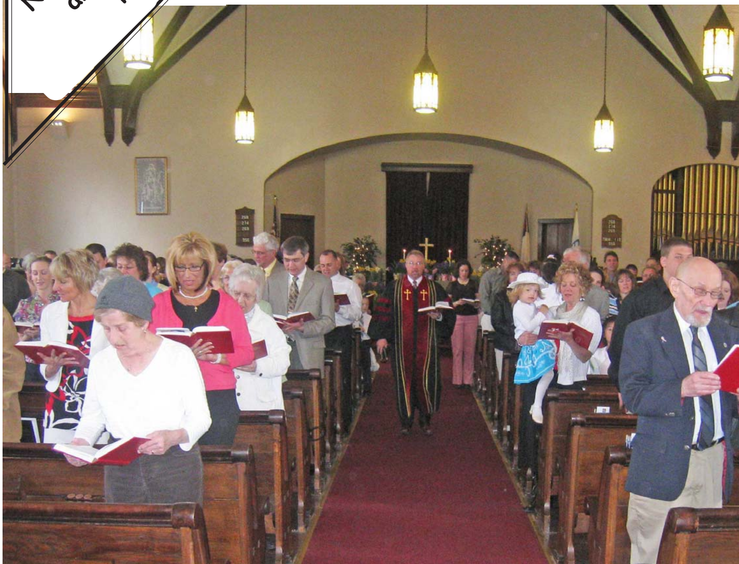
An Easter crowd turned outward to share the great news that Jesus Christ Arose! It was symbolic of what we are doing every week.