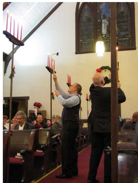
A Brockway father-son candle lighting team.