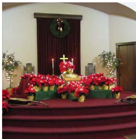
The perfect setting for a service.