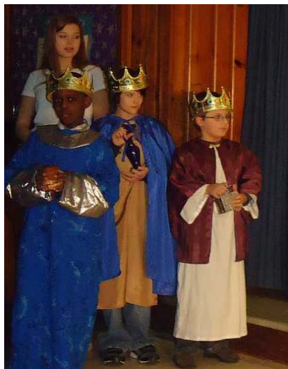
We had kings.