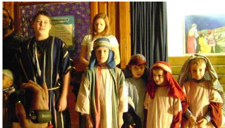
The shepherds wait.