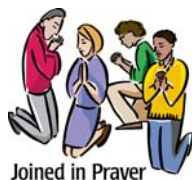
Joined in Prayer

Join us on Wednesday nights at 7:00 p.m. for a series of messages based upon the Gospel of John. Each week we enjoy some special music, a time of prayer and a word of hope as we slow down to spend a little time with the Lord.