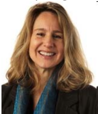
featuring pulitzer prize winning photo-journalist Sally Stapleton

The role of the media in a land beyond genocide