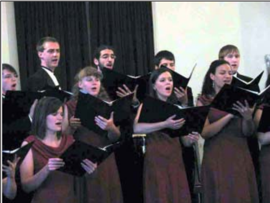
The Eastern University Choir from St. David's, Pennsylvania performed for us on Monday, May 14.