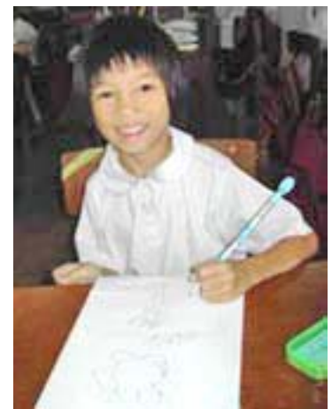
A special ed student at Kim's school

Population: 61,798,000 (2001 est.) Size: 198,115 square miles, 513,115 square kilometers, or about the size of Texas Location: Southeast Asia surrounded by Myanmar, Laos, Cambodia, Malaysia and the Gulf of Thailand Ethnic groups: Thai 75%, Chinese 14% Languages: Thai (official), English, Lao, Chinese, Malay Religions: Buddhism (state religion); Islam; .5% Christian